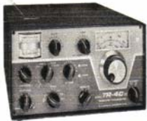
Drake, Collins, Swan, Hallicrafters and most of the older H.F. equipment