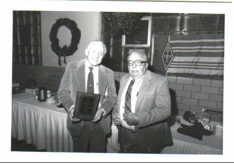
NAME AND CALL OF PLAQUE RECIPIENT AND FOR WHAT?