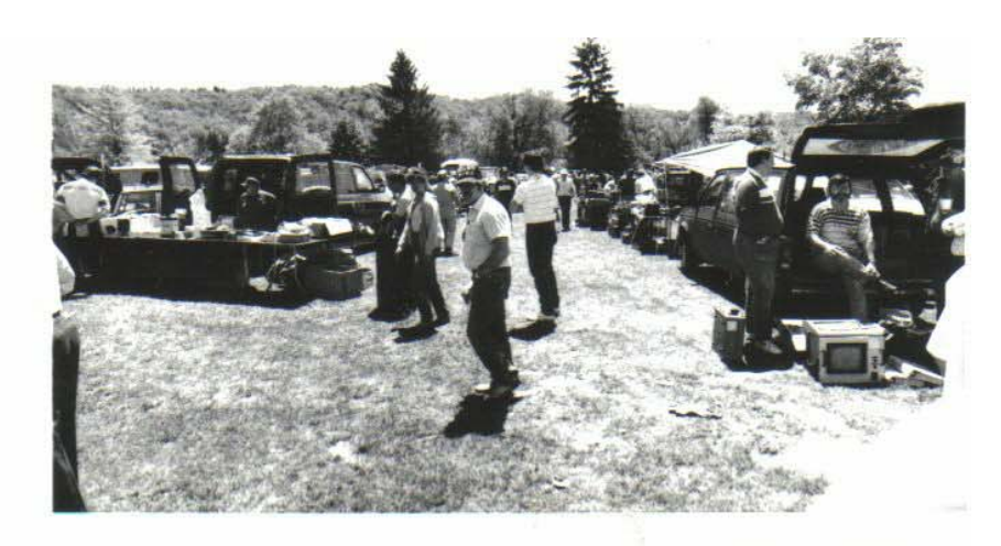
WHAT YEAR FOR HAMFEST?