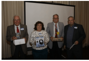
Raffle Prize winners