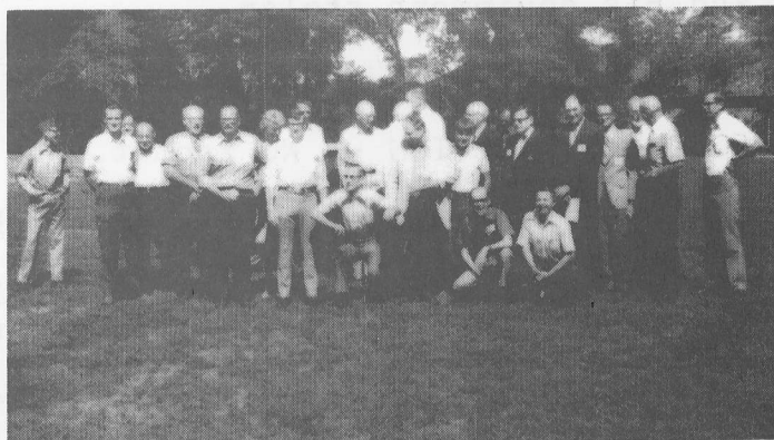
1972 ARMS Convention