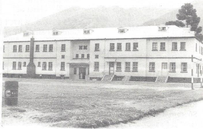
One of the school buildings at Alliance Academy, Quito, Ecuador.

college, interest called for more direct action—not just for selfish reasons but to help many MKs have an occasional contact with their families. How rewarding this has been! Many of you in ARMS have helped me with these contacts, and sometimes they have come at most crucial times.