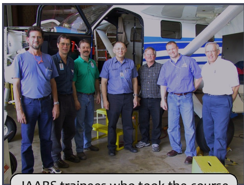
JAARS trainees who took the course.