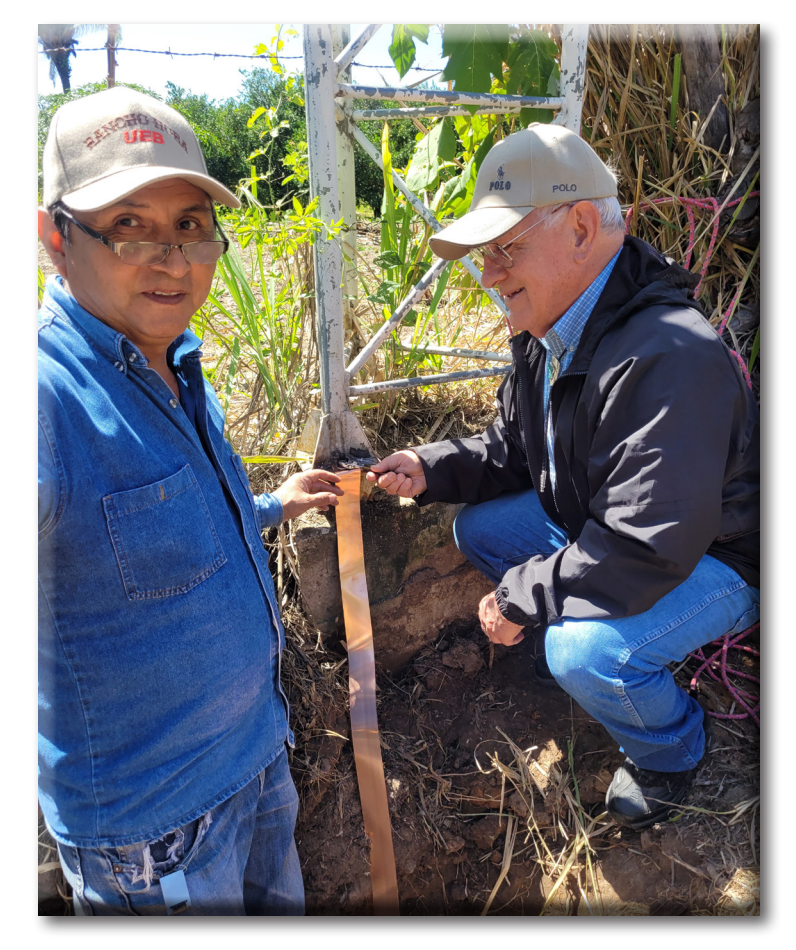
Attaching lightening protection