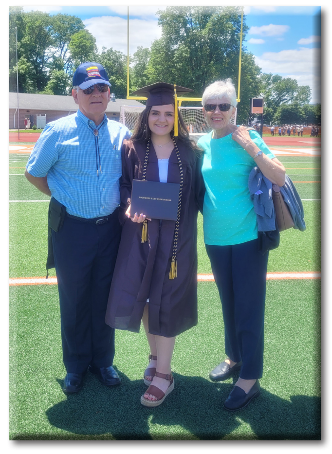
Grandaughter's High School Graduation