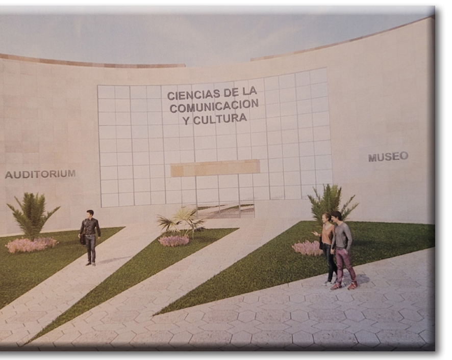
Proposed new Media Center