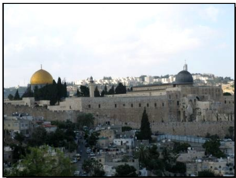
The Temple Mount, Jerusalem

some reading assignments and map work to prepare us for the on-site studies. We stayed at a hotel within the walled Old City for the beginning and end of our stay, with trips south to the Negev Desert and north to the Galilee area.