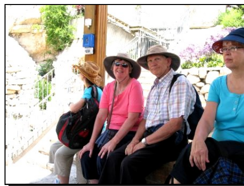
Enjoying good fellowship.

To walk the land of the ancient people of God was a wonderful experience. Now we head to a land where people of God hunger for His Word. We thank you for your partnership in this work and your prayer for our continued efforts there.