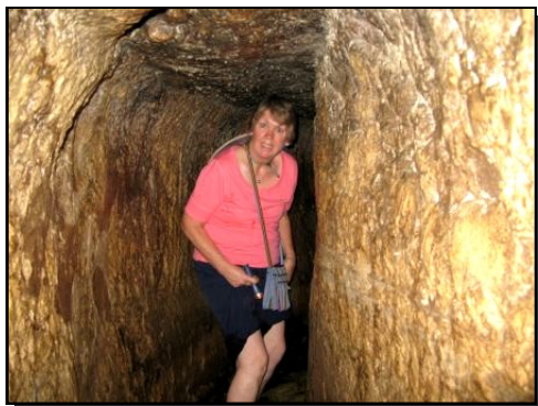
Up to our knees in places walking Hezekiah's water tunnel

Israel into the Promised Land, where Gideon reduced his army to 300 men, and Mt. Carmel where Elijah confronted the 400 prophets of Baal worship.