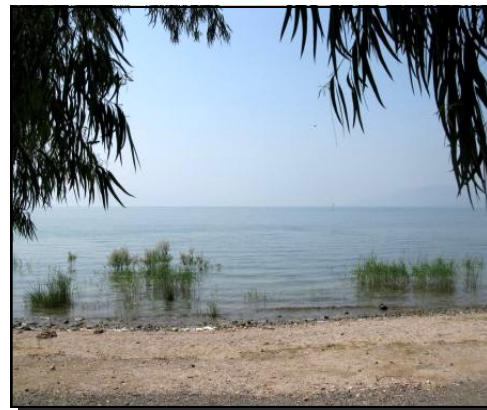
The Sea of Galilee, where Jesus asked Peter if he loved him.