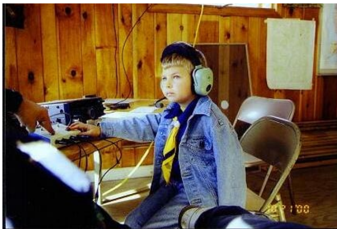
One of the scouts enjoying JOTA