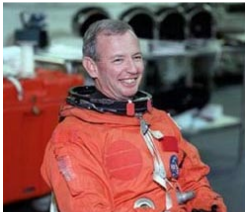
STS-92 Mission Commander Brian Duffy, N5WQW, wearing a training version of the shuttle full-pressure ascent and entry garment during training.

Two Amateur Radio operators are aboard Discovery . They include Mission Commander Brian Duffy, N5WQW, and Mission Specialist Koichi Wakata, KC5ZTA, who will represent NASDA, the Japanese Space Agency. No Amateur Radio activity is scheduled for this mission, however. Others aboard Discovery will include Pilot Pam Melroy, and mission specialists Leroy Chiao, Bill McArthur, Jeff Wisoff, and Mike Lopez-Alegria.