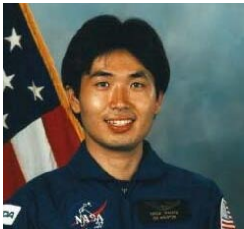
Mission Specialist Koichi Wakata, KC5ZTA, will represent the Japanese Space Agency on STS-92. He'll use the shuttle's robotic arm to attach the Z1 framework and mating adapter to the station's Unity module.

Pressurized Mating Adapter 3 will be attached, providing an additional shuttle docking port.