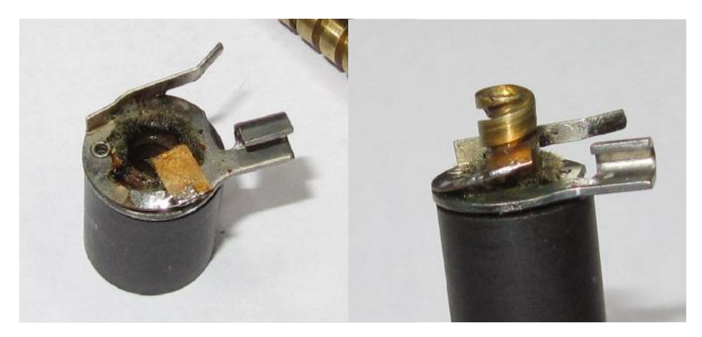
Fig. 3 repaired spring assembly at the PTO core

A piece of brass from an old relay was cut and carefully soldered to replace the missing tip. Fig. 3 shows the repaired core with its spindle.