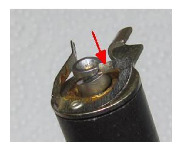
Fig. 2 undamaged spring assembly at another PTO core