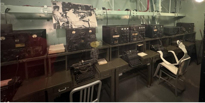
A portion of Radio Central onboard the USS North Carolina (BB-55) in Wilmington, NC.