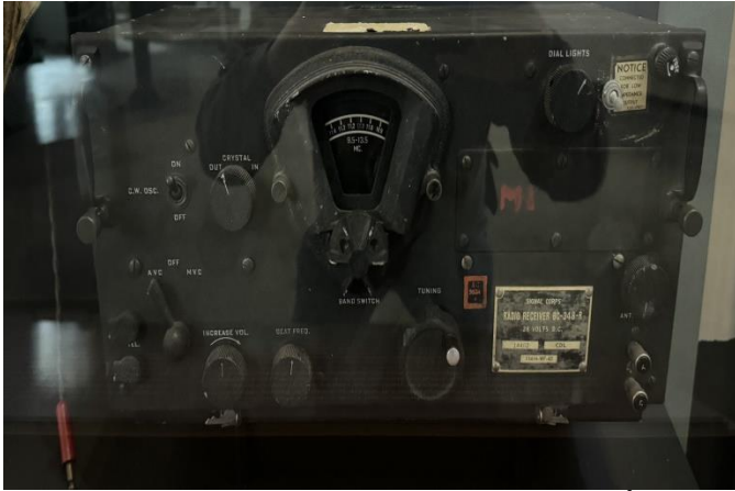
A BC-348-R receiver from a B-17 at the Mighty 8 th Air Force Museum in Pooler, GA.

This year our family decided to head south rather than west for our annual mid-winter getaway. We spent 15 days in Augusta, GA (home of the Masters golf tournament) and 15 days in Wilmington, NC (home of the USS North Carolina, BB-55). Along the way we managed to visit several museums that displayed some interesting radio equipment as you will see below.