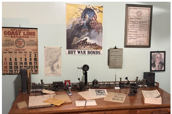
A telegrapher's desk at the Railroad Museum in Wilmington, NC. Note the key and sounder.