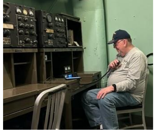
N8NAV as a guest operator at NI4BK onboard the USS North Carolina.