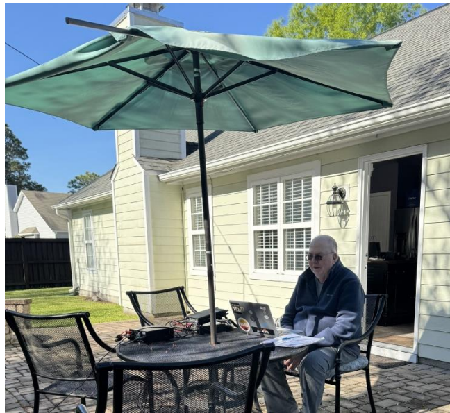
N8NAV's portable operation in Wilmington, NC.