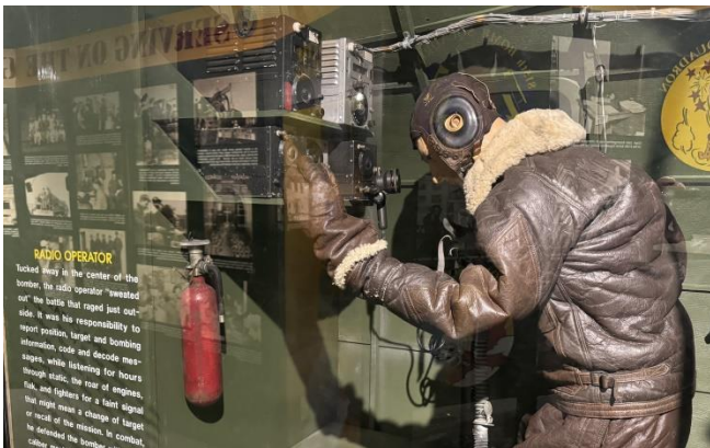
A mock-up of the radio operator position on a B-17 at the museum on Warner Robbins Air Force base in GA.