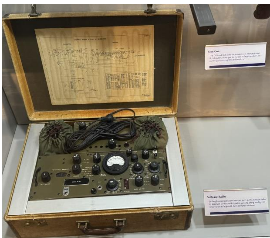
A suitcase radio at the US Army Airborne & Special Ops Museum at Fort Bragg, NC