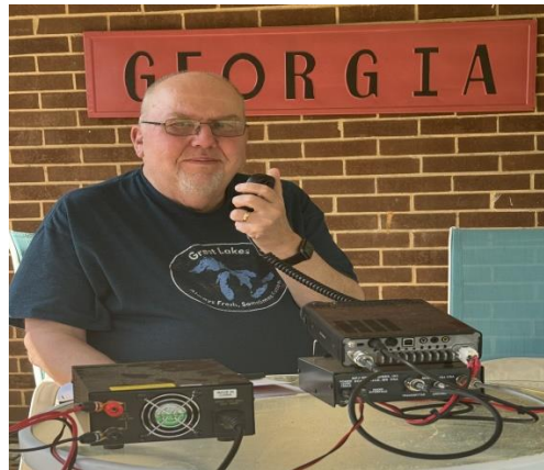
N8NAV's portable operation in Augusta, GA.