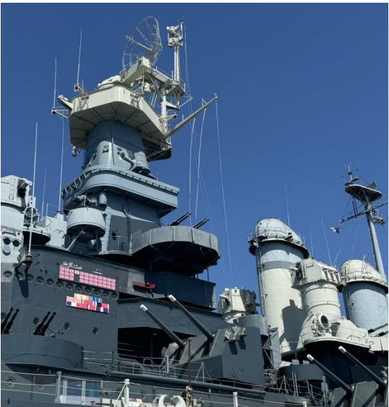
The impressive antenna array onboard the USS North Carolina.