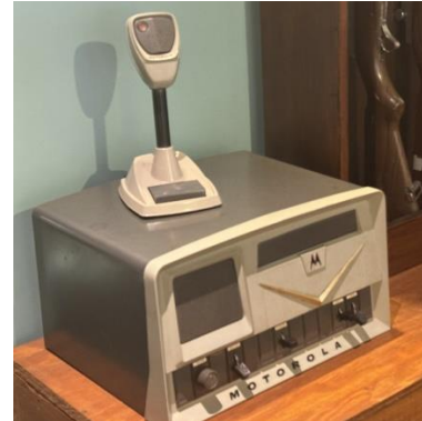
Fans of the Andy Griffith TV show may recognize the Sheriff's office radio which now resides in his museum in Mt. Airy, NC.