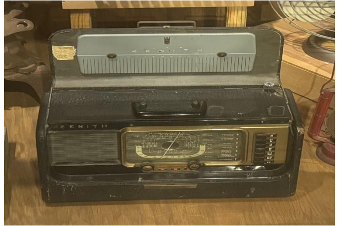
A Zenith Transoceanic at FDR's Little White House in Warn Springs, GA (I have one of these in my collection.)