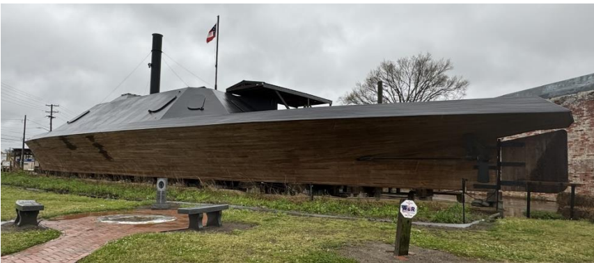
This is a full size replica of the Confederate ironclad CSS Neuse in Kinston, NC. The Neuse is a regular participant in the Museum Ship's Weekend Special Event in June.