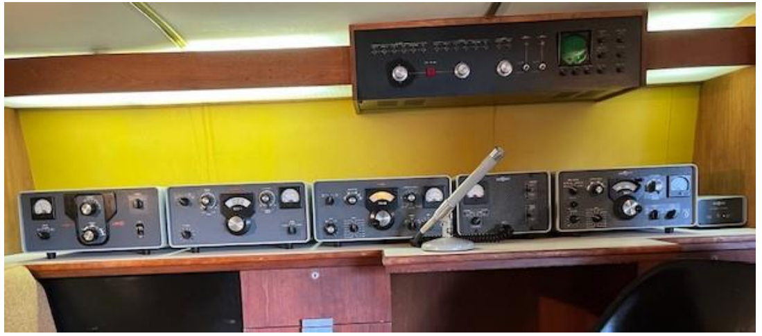
B. From Hamvention 2024, an impressive antenna array and equally impressive radio setup!