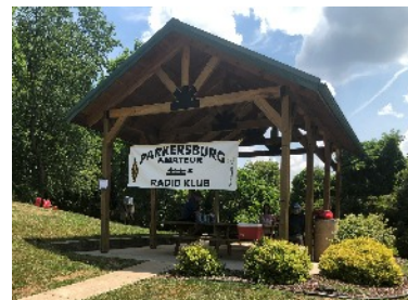
Welcome to Field Day 24