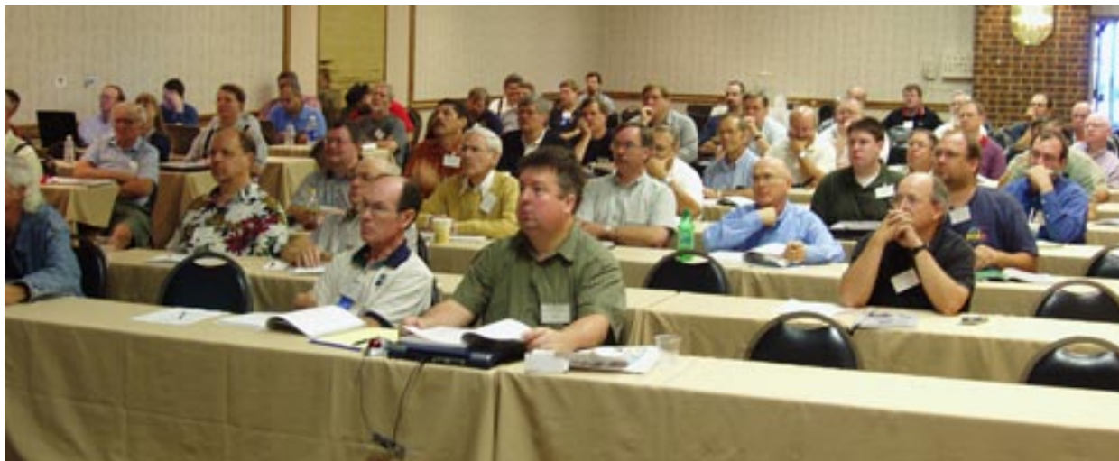
The audience is held spellbound at the DCC.

One of the reasons I wrote the paper was that he had made a statement about power control and spread spectrum many years ago and then made comments to the contrary later. I disagreed with these later statements and I needed to say why.