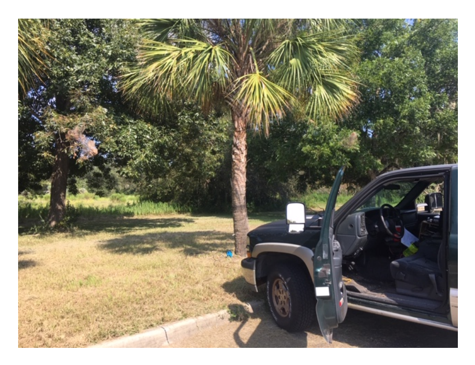
Monitoring Station Location. Wire vertical came down in the palm tree. Blue box visible at the bottom of tghe palm is the 1:49 end-fed balun in a Carlon electrical handy box.