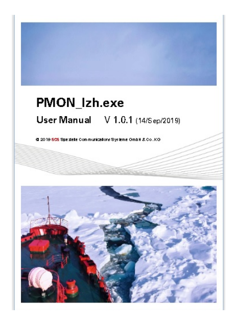
Instruction Manual for on-the-fly Winlink Reader, free software by SCS based on my initial effort, but rewritten by actual software developers.<sup>43</sup>