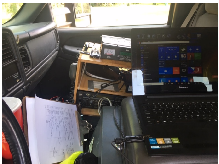
Awkward but usable Monitoring Station.

Because this was 20 meters and I was approximately 9 miles from the "initiating station", I could generally hear the WINLINK pactor calls initiated from KX4Z gateway station, running RMS_RELAY (the standard gateway software). They were NOT strong. Getting those calls to occur took some