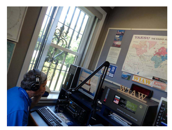
Don at W1AW