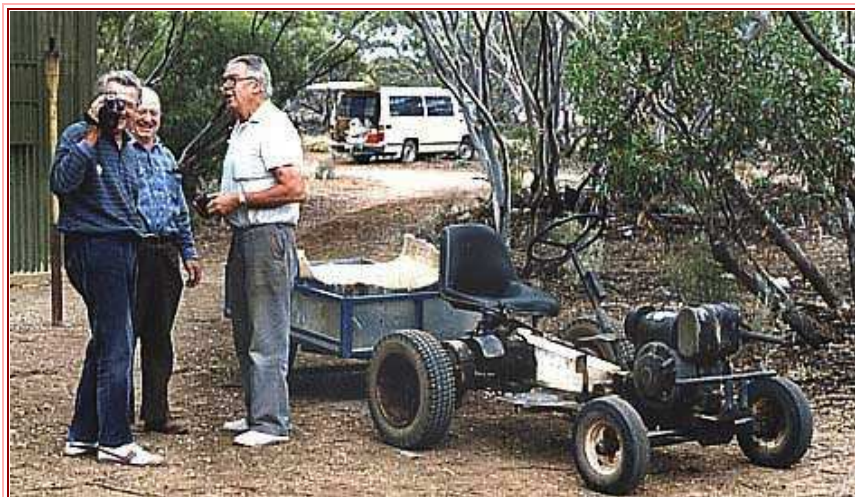
The Wombaroo Taxi