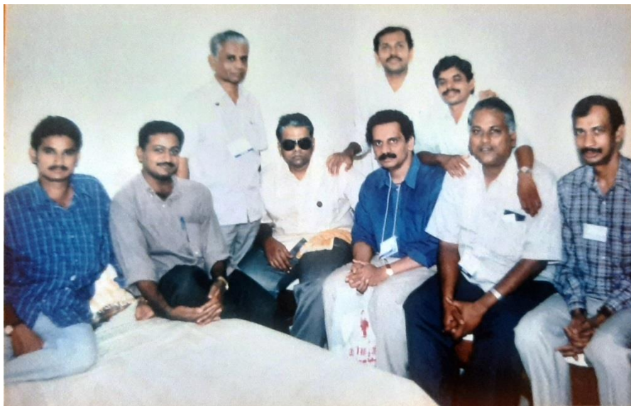
BCDXers at Hamfest India, Chennai in Dec 2012