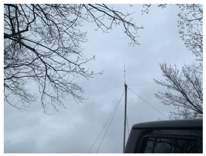
The 2-meter antenna sits atop a mast erected at Cushion Peak