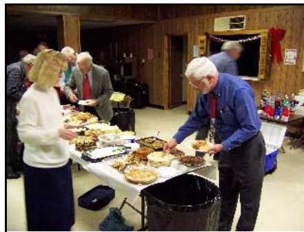
The fellowship and outstanding food are the best part of the Brightleaf ARC Christmas party.