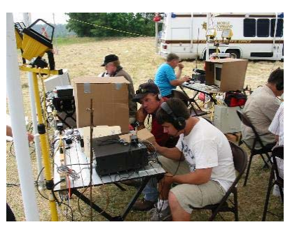
2003 BARC Field Day

The pot luck supper will begin about 6:00 PM. Remember to bring a covered dish. Sunday the 27 of June about 12 noon we will start taking the stations down. So if you have not been to a club activity this year, kick off your summer by coming out to Field Day getting on the air and helping the club get lots of points.