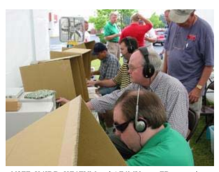
N8FF, K4IDD, KF4ZVM and AF4MY start FD contesting.