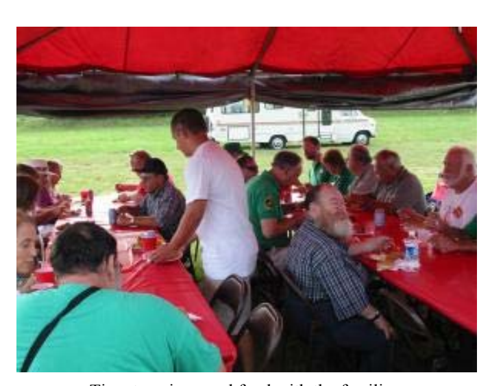
Time to enjoy good food with the families.