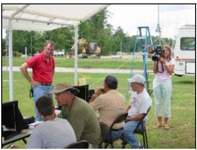
WITN-TV, Channel 7 reporter taking videos of the contest operators. It was on the 6 PM News.