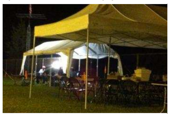
Early Sunday morning operations. A great time was had by all.