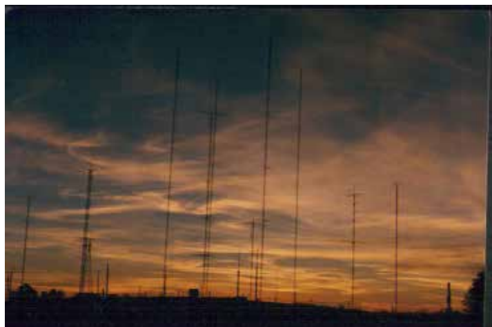
W0AIH 'antenna farm'