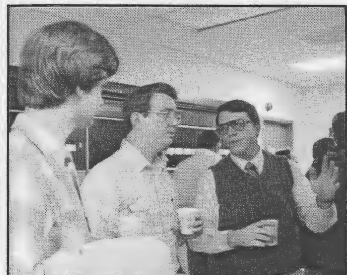
This would be great in my shack.