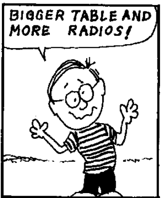
Via ARNS Bulletin