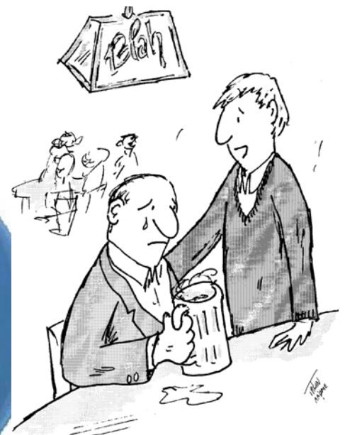
'You've gotta let it go, Al. We all miss Heathkit.'