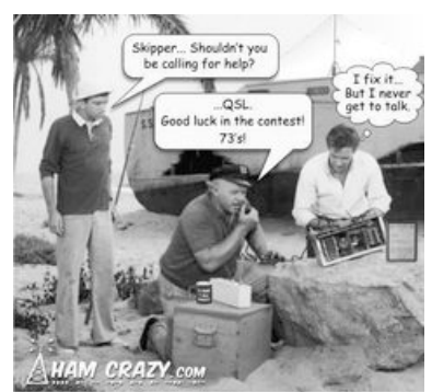
For those of "us" old enough to remember the "three hour tour"!

The Jefferson County Club will have their next meeting on May 10, 2016 at 7:00 PM. This club meets the second Tuesday of each month.