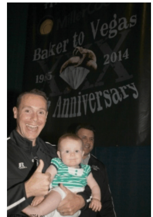
Everyone had a good time!