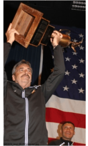
A LAPD team won the race with the fastest time, just under 13 hours.