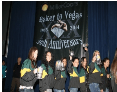
A total of 18 teams won awards.