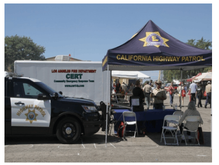
CHP and LAFD CERT attended.