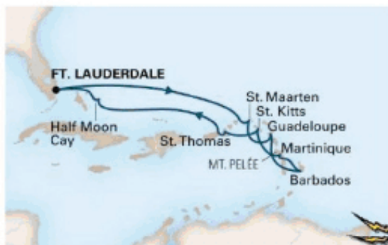
11-Day Southern Caribbean Wayfarer Roundtrip Fort Lauderdale

Don't miss this exciting opportunity. Sail the seas with your family & QCWA friends to promote Amateur Radio World Wide