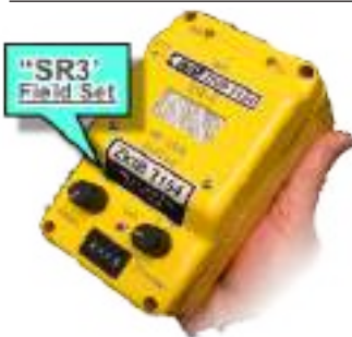
SR3 FIELD RADIO - NZMRS