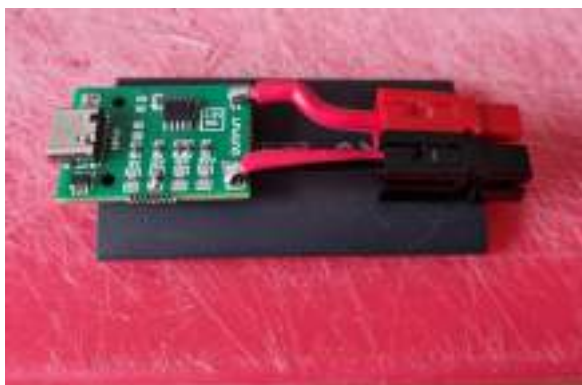
IMAGES OF TRIGGER BOARD - ZLSOTA FACEBOOK POST

This piece of tech comes courtesy of a post by a ZL-SOTA facebook member. A usb trigger board is equipped with jumper pads that allow the user to set the board to 9,12,15v outputs. Beware the trigger board may only be limited to 3-5A output, although the power bank may be limited further also to a particular output. I personally carry a power-bank on multi day trips in the bush to charge my headlamp, gps and phone etc so this could be a good addition to adapt the power source to power my KX2 in the field without carrying a separate power source. These can be bought online or aliexpress.