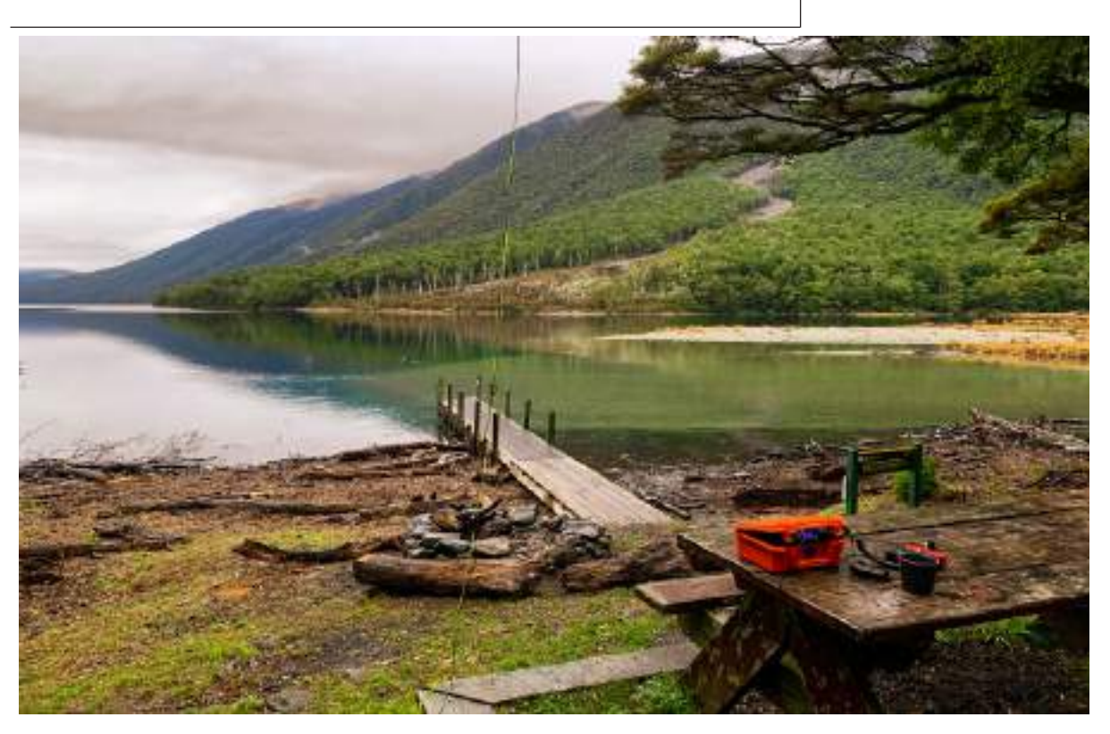
LAKE ROTOITI - AUTHORS IMAGE.