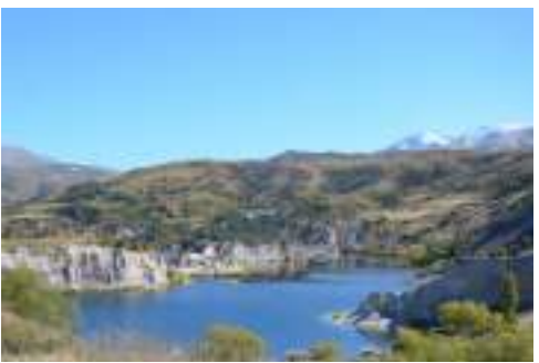
Blue Lake - St Bathans