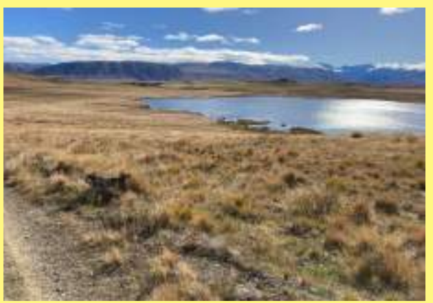
Lake Emily - Hakatere Conservation Park.