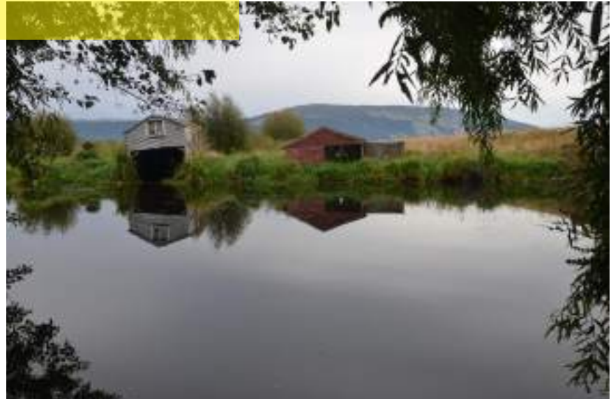
Lake Waipori - Southwest of Dunedin, Credit: Stewart ZL2STR